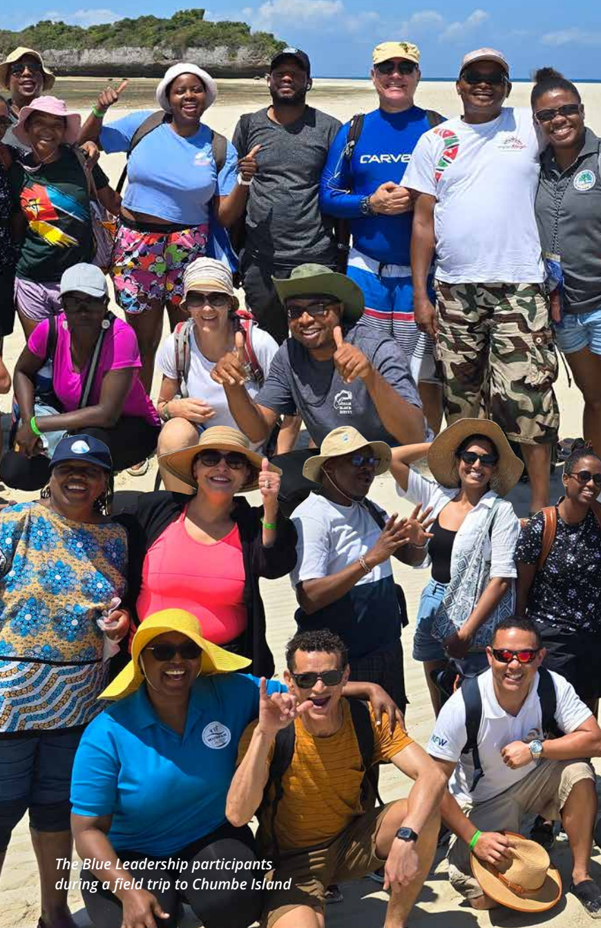
The Blue Leadership participants during a field trip to Chumbe Island