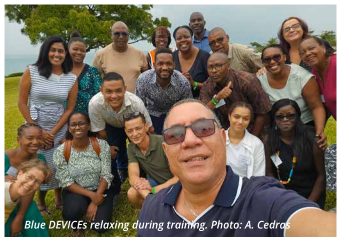
Blue DEVICES relaxing during training.

The trainees agreed to continue to work together to create a multiplier effect while remaining active within the community of Blue DEVICES. The integration of participants from Namibia and Tunisia was as a result of WIOMSA’s membership of the African Ocean Decade Taskforce and its interest in developing capacity across the continent.